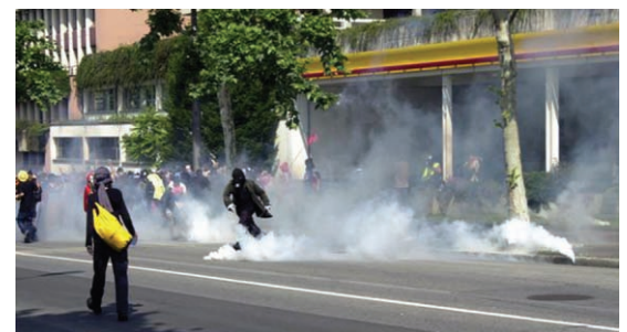
Use of tear gas at demonstration at the time of the 2003 G8 summit, Lausanne, Switzerland

Of the known disabling chemical irritants (of which there are more than a dozen), the five that are traditionally used in the European Union are chlorobenzylidene-malononitrile (also known as CS, after the chemists Corson and Stoughton who first synthesised it), chloroacetophenone (CN or “Mace”), dibenzoxazepine (CR), oleoresin capsicum (OC), and pelargonic acid vanillylamide (PAVA) (figure). 6 Diphenylamino-chloroarsine (DM or adamsite) is an irritating and harassing arsenic based agent used in some countries outside the EU. Oleoresin capsicum is a mixture of cayenne pepper extracts, of which capsaicin is the main active ingredient. 4,7 Its concentration varies from 1% to 15% depending on the mixture. 7 Pepper strength is measured in Scoville heat units, ranging from zero for green pepper to 15 million units for pure capsaicin. 8 Pelargonic acid vanillylamide is a new standardised synthetic variant of oleoresin capsicum used mainly in Switzerland, Austria, and Germany. 6,7